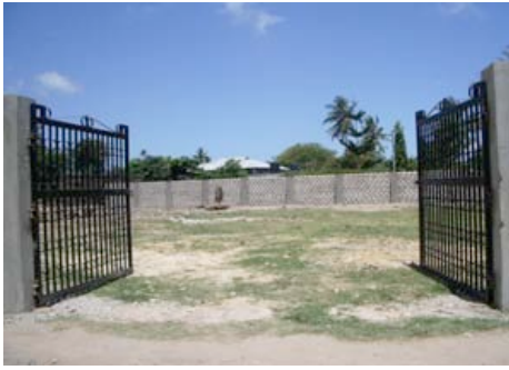
This is the site of the new school